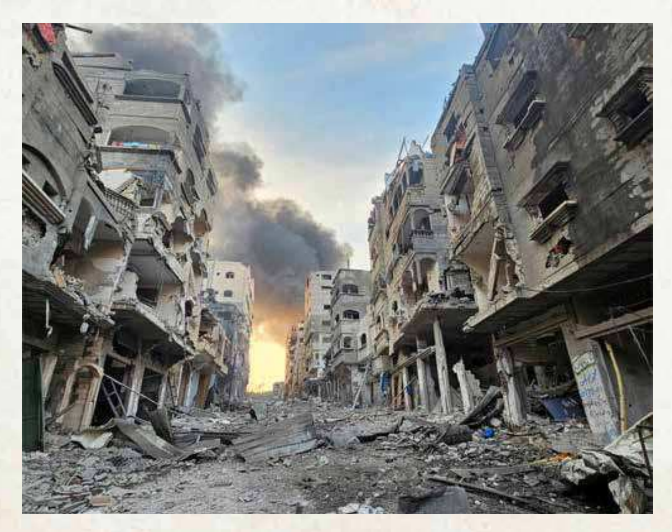
Destroyed neighborhood in Gaza.

Human rights organizations and the head of the United Nations-along with others-have declared a humanitarian disaster. Still, we don't understand how some Christians still support the ongoing indiscriminate attacks on Gaza and their country's supply to Israel of weapons, intelligence and cover from international law-in spite of the fact that Israel's colonial, racist apartheid project has turned now into an ongoing genocide.