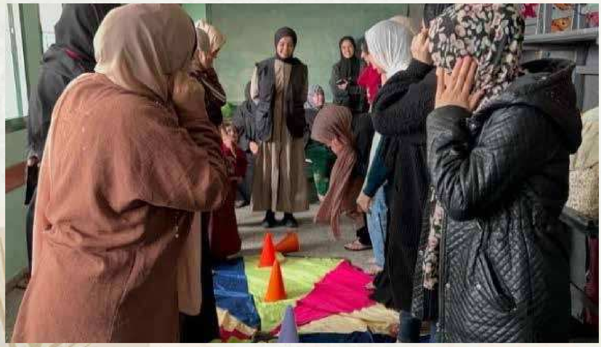
MECC-DSPR in Gaza has 103 staff to run the clinics, centers and outreach activities covering the whole Gaza strip. (MECC-DSPR)