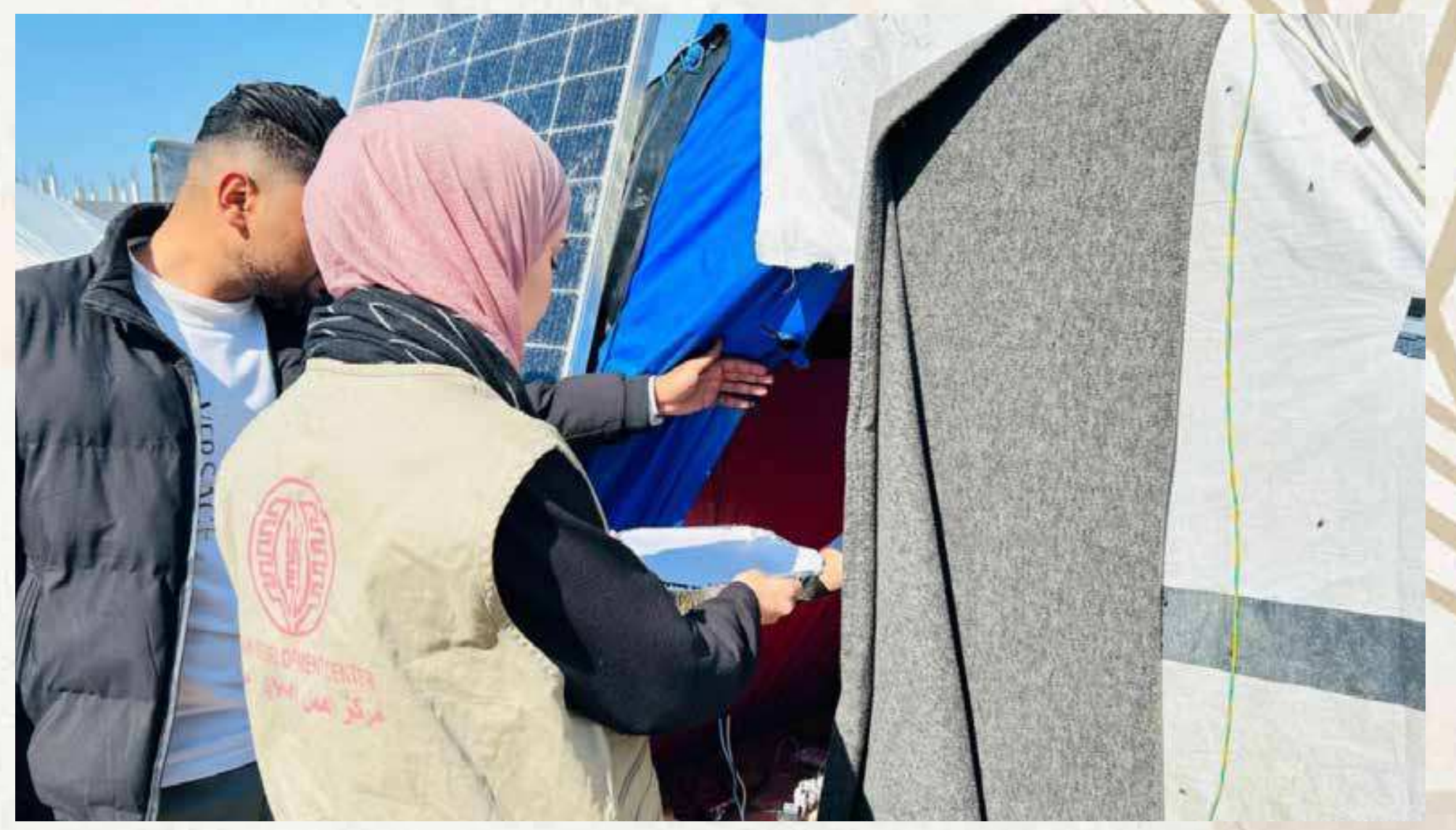
Ma'an center has provided more than 44,000 hot meals for 88,000 individuals in central and southern Gaza (Ma'an Development Center).

Account Name: MAAN Development Center Bank Name and Code: Bank of Palestine, 89 Branch and Branch Code: Al Masyoun, 471 Account #: 605424/00 IBAN Code: PS48 PALS 0471 0605 4240 0130 0000 0 (USD currency) PS33 PALS 0471 0605 4240 9930 0000 0 (ILS currency) Swift Code: PALSPS22