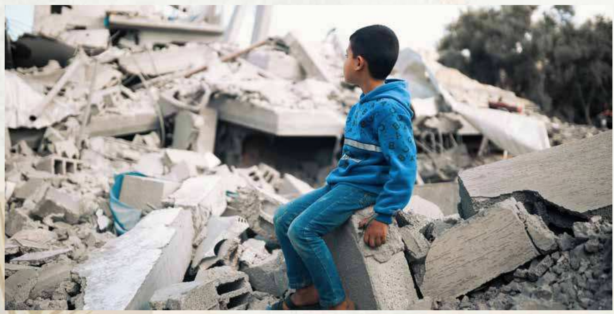
Displaced Palestinian child in Gaza sitting on the rubble of his house

About 19,000 children lost the warmth of their families or were separated from their parents during the war in Gaza, which increases the number of those without family care in Palestine to more than 70,000 children. For them, growing up is often more about survival and basic needs than playing and learning. We work at SOS Children's Villages Palestine to provide alternative care for dozens of children, focusing on the trust and warmth of strong human connections. We succeeded in opening a shelter for unaccompanied children separated from their parents due to the war in Gaza. In light of the continuing war and the economic situation that families are experiencing in Gaza and the West Bank, SOS Children's Villages has been able, over the past few months, to provide cash assistance to more than 6,700 individuals, children, and families, and has implemented more than 2,700 extracurricular and recreational